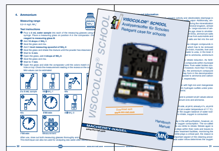
Extensive manual with valuable background information

Optionally, the case can be equipped with a pack of pH-Fix or QUANTOFIX® test strips as well.